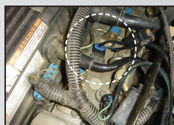
03-07 Dodge 5.9L