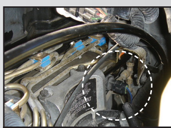
98-02 Dodge 5.9L

Notes: 98-04 Dodge users will see best results when used in conjunction with an adjustable boost elbow installed in the line going to the wastegate actuator.