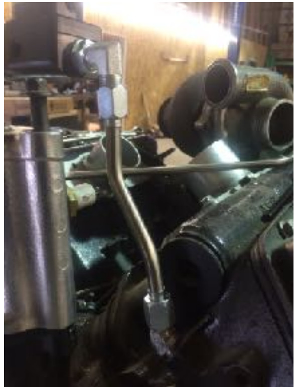
GEN3/Dual pump rear lines. Can be used on any model